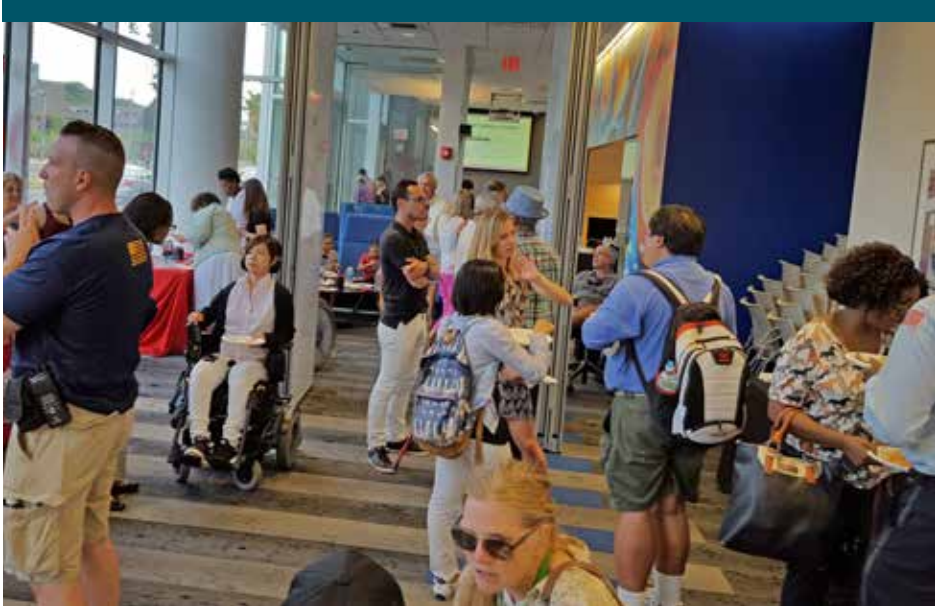
Guests mingle at Northeastern Crossing's first Neighborhood Night last month.