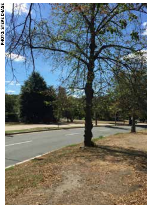
Park Drive shows symptoms of the drought: naked tree branches, brown grass, and dead leaves.

Quoting a Chinese proverb, Mauney-Brodek said, "The best time to plant a tree was twenty years ago. The second best time is now. We want to make sure they are as healthy as