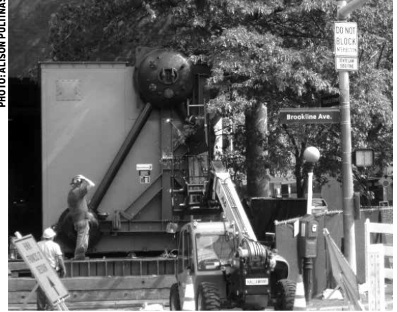
Following a final regulatory OK, workers began preparing the MATEP plant to receive a third turbine.

Celebrating our first year of elevating and showcasing the voices and visions of our community