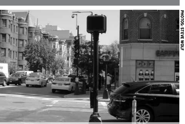
Many of the same buildings line Westland Ave. today, but the historic building with Hemenway Drug burned and was replaced in the early 2000s.