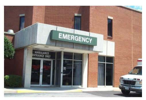
Health care institutions are recognizing that housing stability leads to better health outcomes.

"Housing is health care" has become something of a mantra for housing advocates in recent years. A growing number of health care institutions have started to recognize the well-established link between housing stability and health outcomes as well, with many directing their community investment dollars into affordable housing development to boost housing stability, and thus health, in the communities they serve.